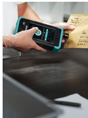
Figure 1. Finding contraband—from fentanyl to anthrax—in the mail is a very real issue. The ability of Raman to scan through paper is an invaluable asset.

TID1064ST with the See-Through (ST) Smart Attachment can measure samples situated inside bottles, envelopes, and even dense chemical storage containers. A unique data analysis algorithm quickly identifies and separates the container signature from the sample signature, accurately identifying both.