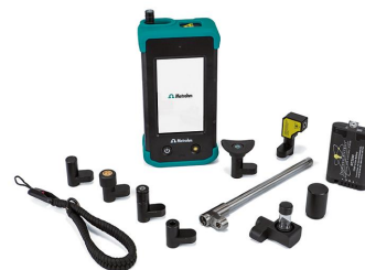
Figure 2. TID1064ST has a suite of sampling attachments for any scenario.