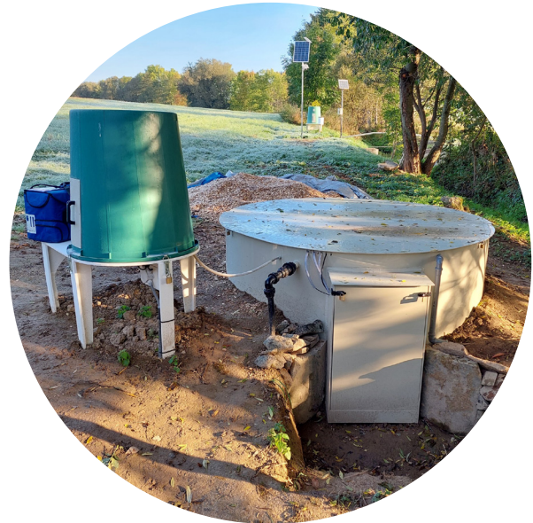
Figure 1: A real example of an installed semi-operational bioreactor unit.

The project is being realised under the leadership of ALS Laboratories in cooperation with other research institutes. Work on the project will continue until 2025.