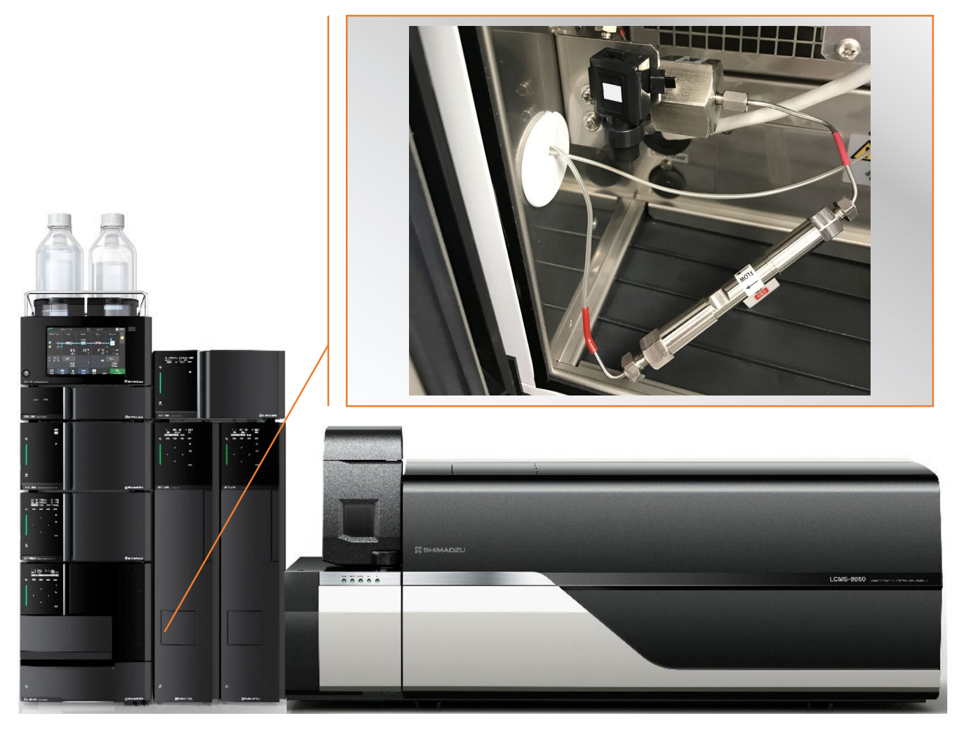
Figure 2: Installation of delay column

Another common practice for the trace analysis of PFAS has been to modify the standard vial and cap selection most commonly used by laboratories. The use of polyproplyene vials and enclosures is common, however, polypropylene caps have the disadvantage of not resealing after injection, thus risking compromise to sample integrity.